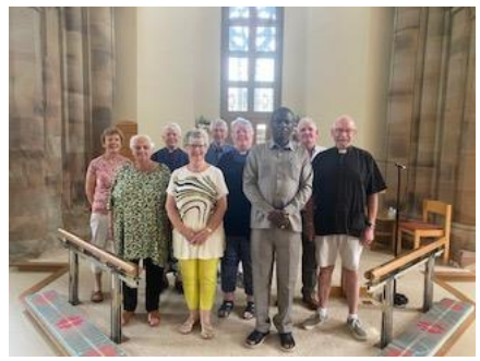
Royra and surrounding districts.

On arrival we showed him round the Church and the grounds and told him a bit