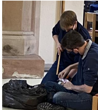
Making an eco brick!

Do bring to any of our churches once we are open again - or leave under the Buddleia bush in our front garden (on the right at the top of the steps). I have put a black bowl there. Leave your Eco-Brick and take an empty if you like.