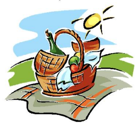
Here comes the sun!

Why not come and join us at Beaumont Park?