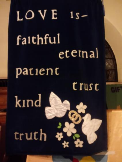
Two of the banners from St John’s that now reside in Holy Trinity.